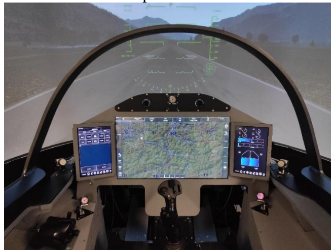
Figure 3: Cockpit simulator with integrated eye-tracking

The second step of this study was the implementation and evaluation of a cockpit adaption in a representative task setting. For this, we implemented 12 different adaption use cases in our cockpit simulator (see Figure 3). Cockpit adaptations were either a computer-generated text message or an indication on the tactical map.